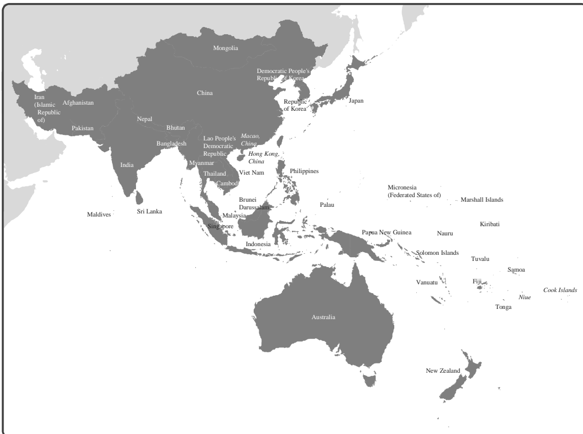
38 Members and 4 Associate Members of the APT